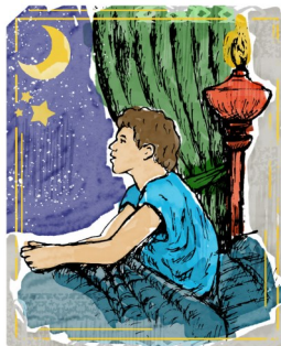
Answer: D (See 1 Samuel 3:1-10)